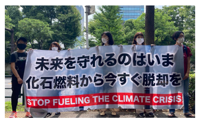
Protests against Japanese companies to move away from coal-fired power generation (June 24, 2022, Tokyo, Japan).